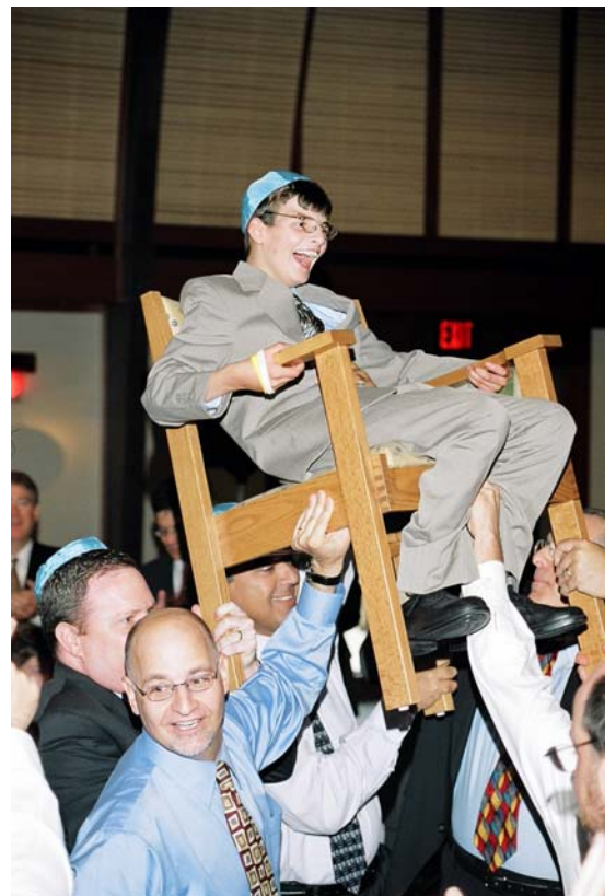
“It takes a Village to Raise a Child”