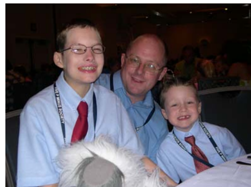
The three handsome Piepergerdes boys!!